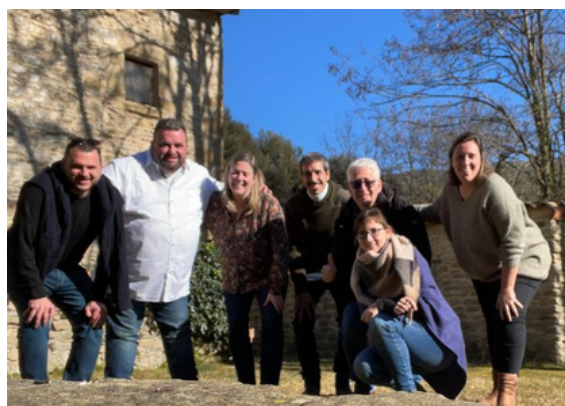
Kick-off workshop with Wenable in Barcelona